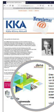
KKA Kälte Klima Aktuell newsletter