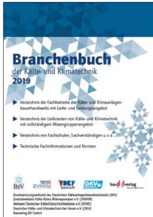
trade directory refrigeration and air-conditioning technology

By order of the trade association BIV we will publish the most comprehensive trade directory of refrigeration and air-conditioning technology. From an editorial point of view, the publication will offer annually the addresses of all association members, both in alphabetical order and arranged by postcode, the addresses of all important suppliers and manufacturers in the field of refrigeration and air-conditioning technology, a list of all suppliers arranged by categories which will allow to find quickly the appropriate suppliers for a product selected and important standards, regulations, provisions as well as chemical and physical basics for manufacturers of refrigerating plants.